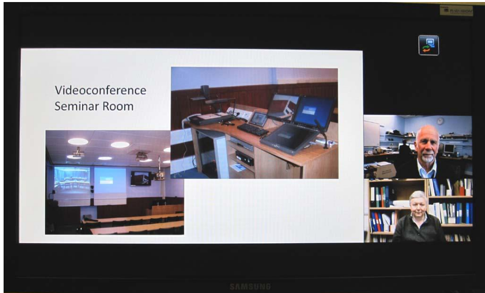
H.239 Call, large presentation image, small near and far images, Transmit End *