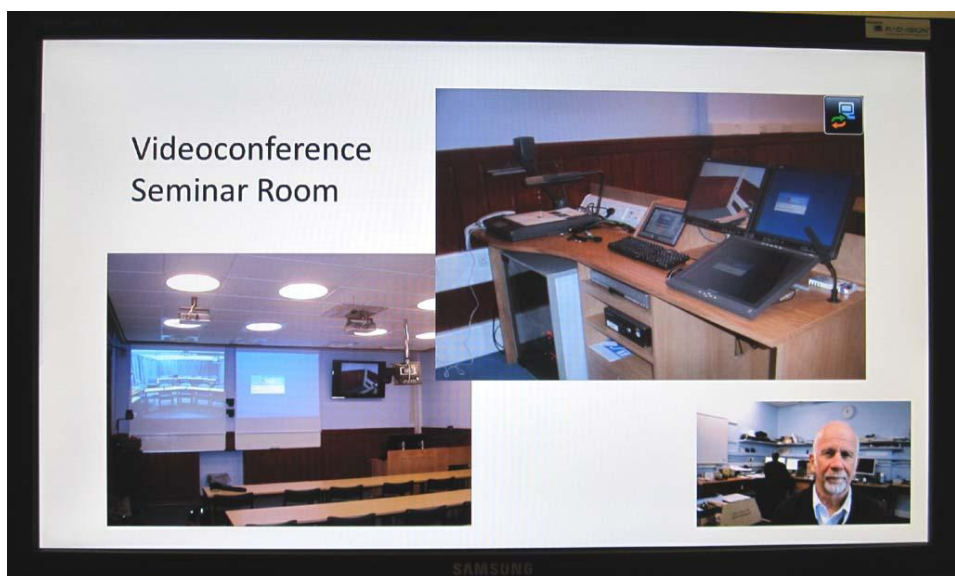
Full screen presentation with far image PIP