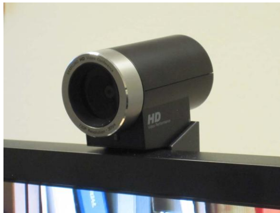
720p High Definition Camera

Manufacturer: RADVISION Model: SCOPIA® VC240 Software Version: 2.5 Optional Features and Modifications: None Date of Test: 11th – 15th April 2011