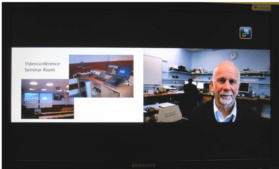
Presentation and far images side by side