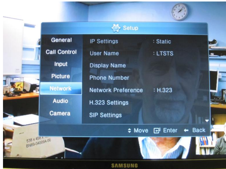
System setup menu

The system is limited to set up and control via the infra-red remote control. The on-screen menus are both logical and easy to use.