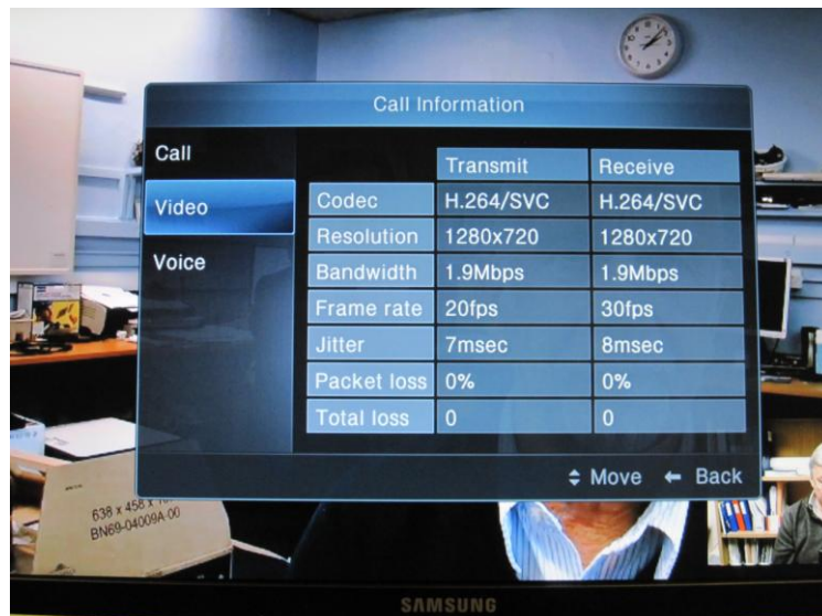
Call information menu

The comprehensive call information menu displays call status data including connection bandwidth, frame rate, compression protocols and packet loss. During the evaluation, in calls with some other vendors' systems, although moving images were in fact being transmitted the menu indicated zero (0) transmitted frame rate.