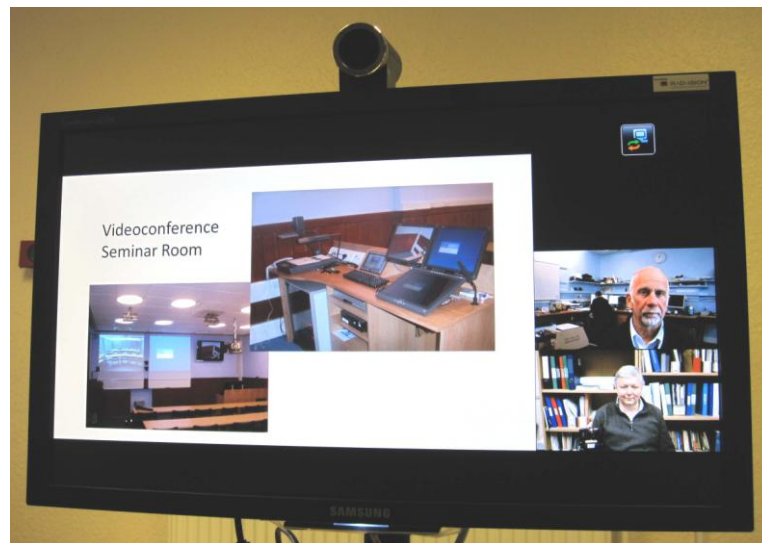
SCOPIA® VC240 System