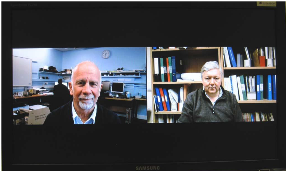
Far and near image side by side