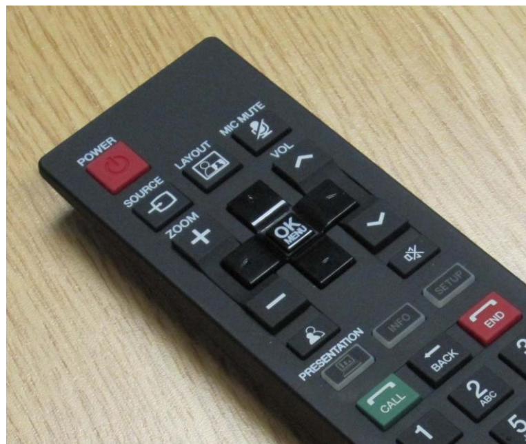
SCOPIA® VC240 Remote Control

The “Source” button on the remote control selects the input to the display screen from the VC (CODEC) output or either of the PC analogue or digital sources. Selecting a PC source allows the user to preview their computer output during a conference or as a PC monitor when not in a call. The “Layout” button on the remote control cycles between the available screen layouts. Microphone and loudspeaker mute buttons are also available.