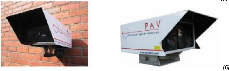
Table 1: Technical specification of PAV ET 2000 system