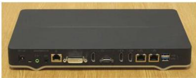
CODEC Rear view